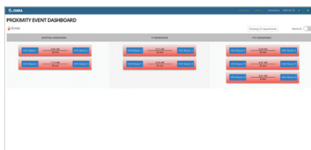
Proximity Event Dashboard

See populated Proximity Events with web-based reports to gain actionable insights into workplace safety with 60-day data storage. Employee activity can be viewed live on the dashboard, historically by day or week and filtered by specific criteria like user ID. Export data for processing using your choice of business intelligence tools. Additionally, the administrator view allows you to monitor your fleet of sensing devices, providing a device health check dashboard.